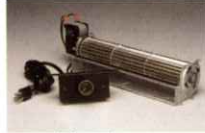
Variable Thermostat Controlled Forced Air Blower