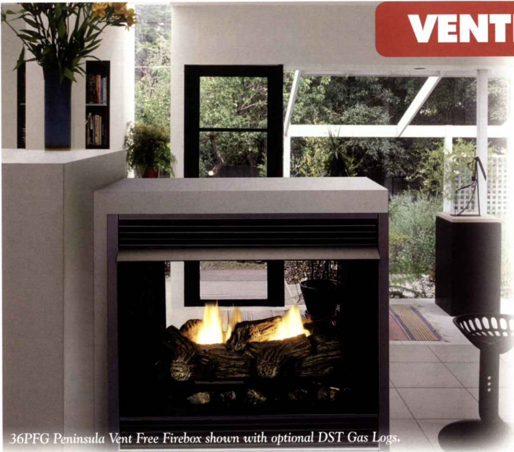
36PFG Peninsula Vent Free Firebox shown with optional DST Gas Logs.

What a beautiful way to enjoy a roaring fire! The Peninsula offers a three-sided view and unique design possibilities.