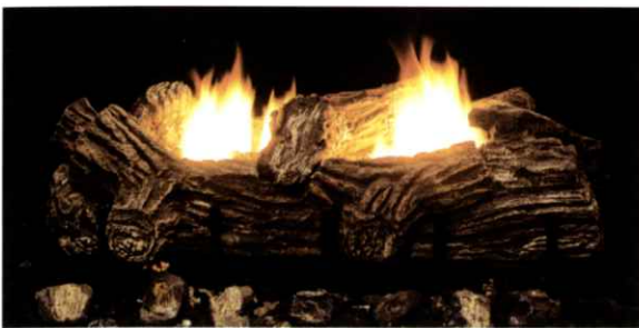
DST Vent Free Gas Logs - Side A