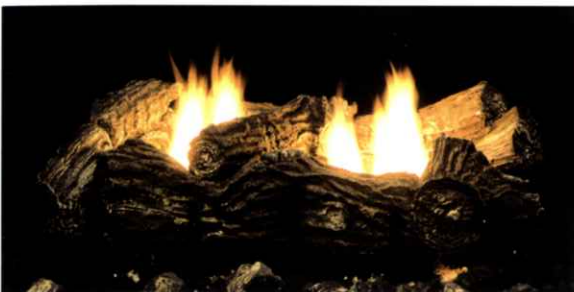
DST Vent Free Gas Logs - Side B