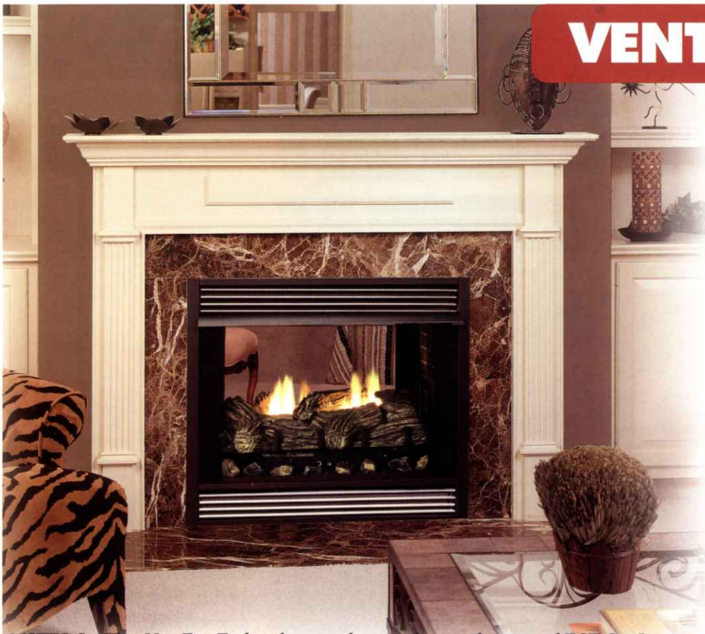
36STFG See-Thru Vent Free Firebox shown with optional pewter louvers and DST Gas Logs.

Imagine having the ability to connect two separate rooms with a single fireplace or divide a room into two living areas, creating a unique, stylish appearance.